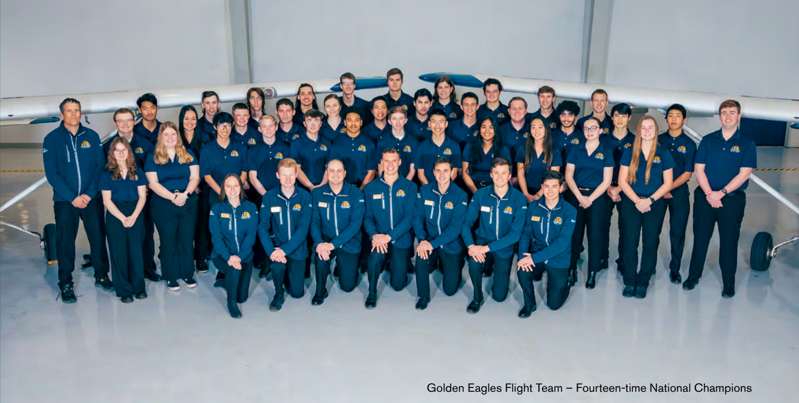
Golden Eagles Flight Team – Fourteen-time National Champions