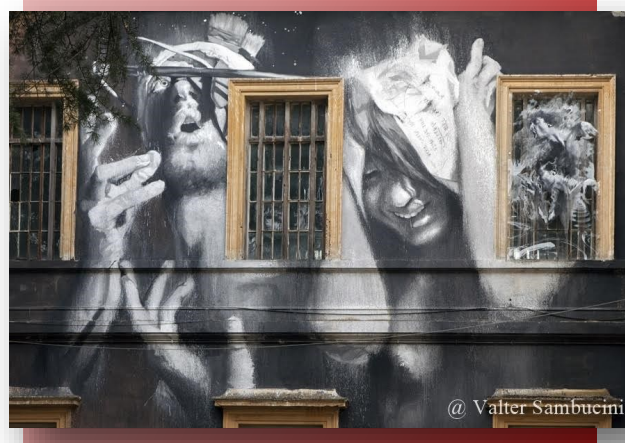
Museo della Mente (Museum of the Mind)

The more students who sign up, the lower the price to attend—encourage your friends, your roommates, and your classmates to join us for a summer of Science and Society on the Global Stage!