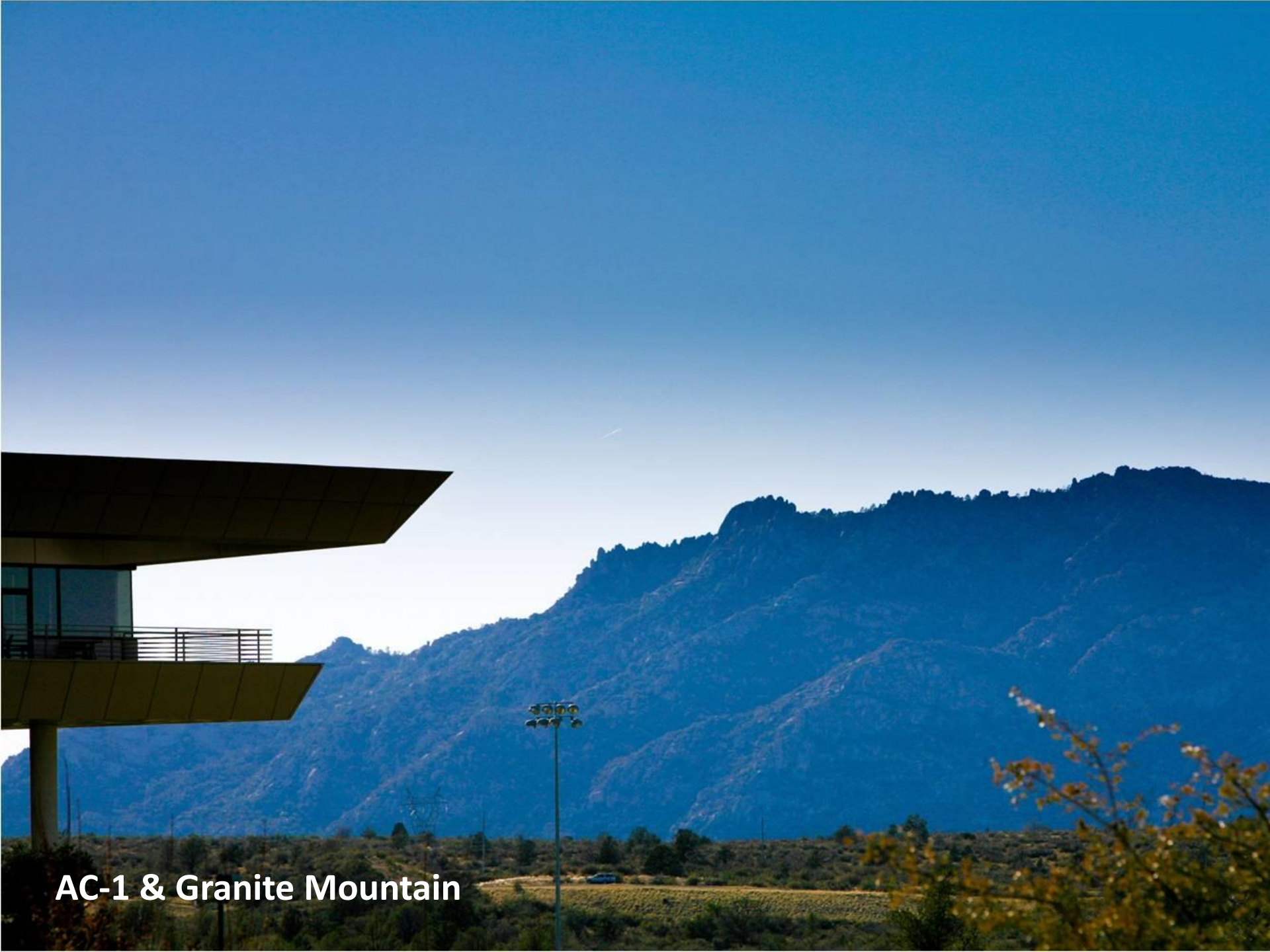
AC-1 & Granite Mountain