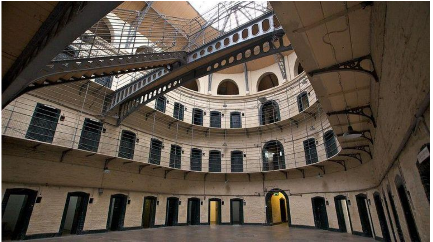
Kilmainham Gaol Easter Rising 1916

National Security Tour: Kilmainham Gaol, a former prison where Irish revolutionaries, including leaders of the 1916 Easter Rising were imprisoned and executed by the British.