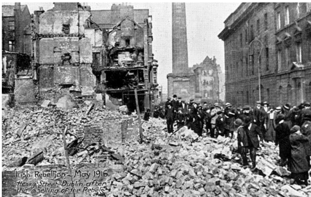
Irish Rebellion - May 1916 Henry Street, Dublin, after the shelling of the Rebels