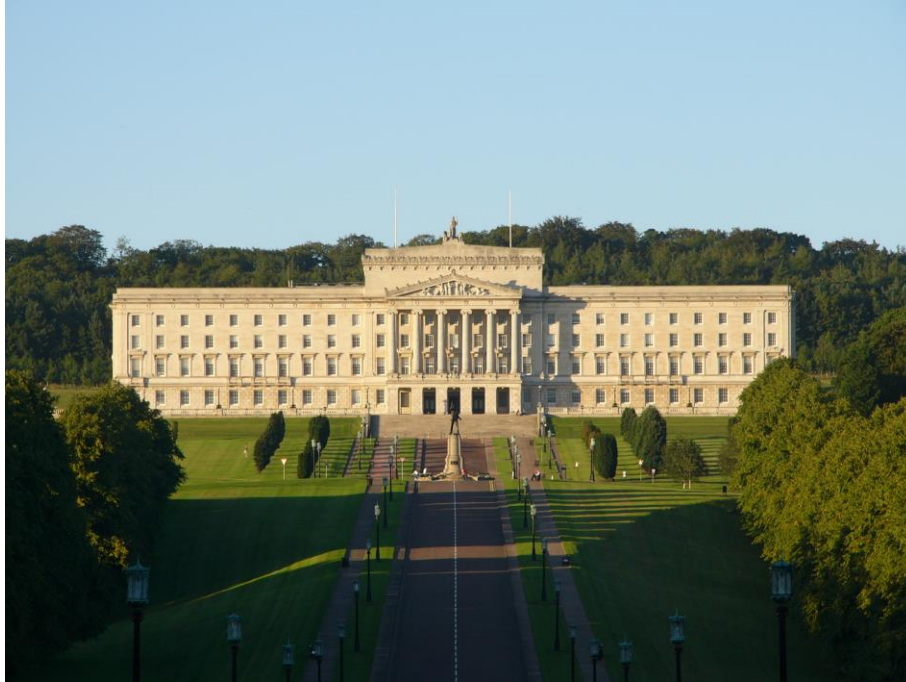
Northern Ireland Assembly