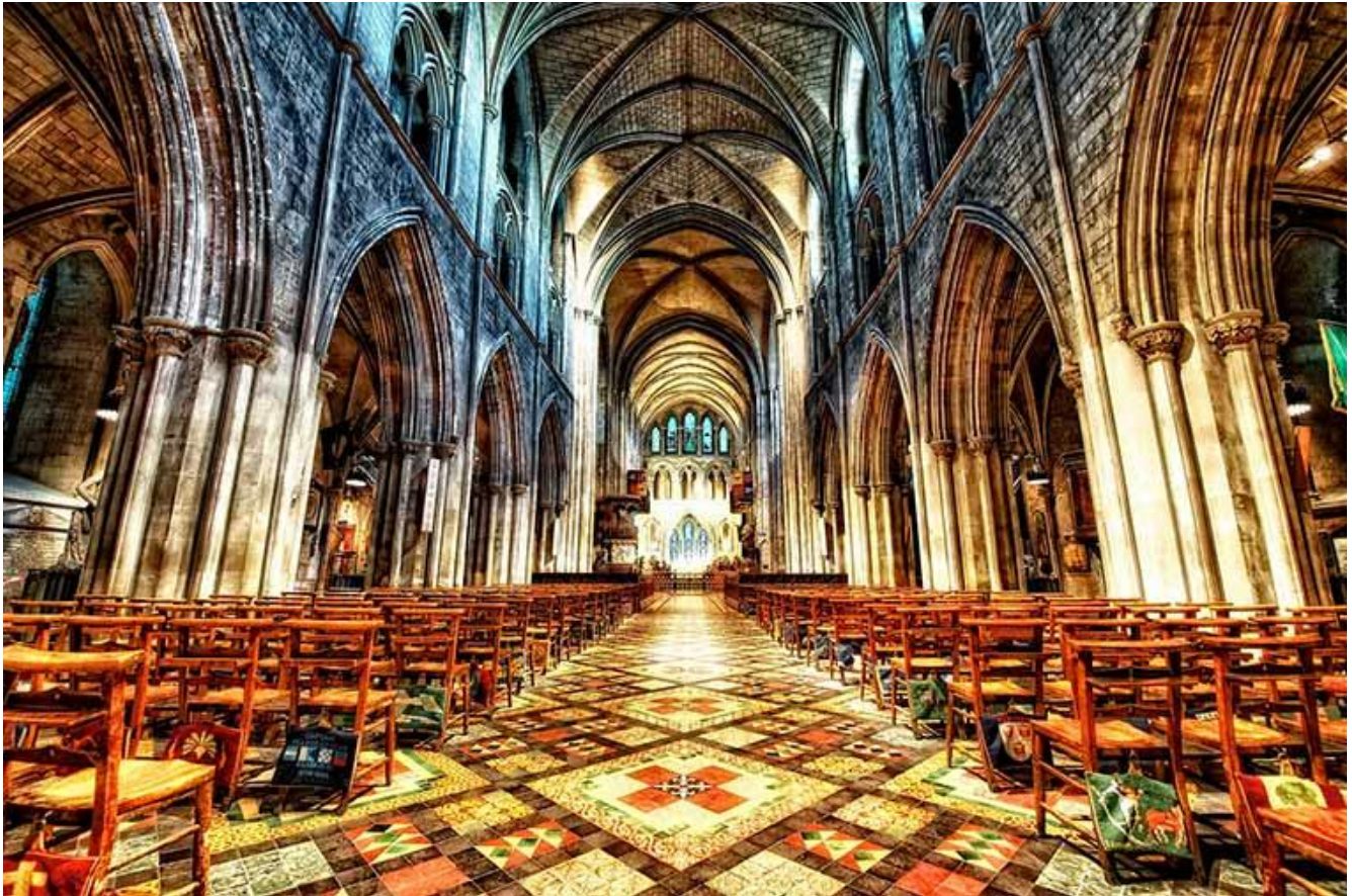
St. Patrick's Cathedral Trinity College Library