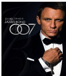
DANIEL CRAIG IS JAMES BOND 007