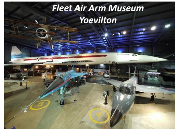
Fleet Air Arm Museum Yeovilton