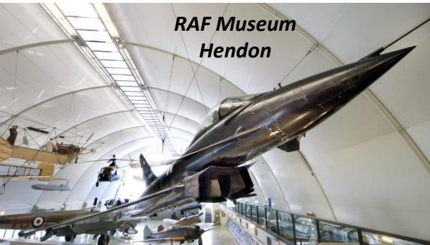
RAF Museum Hendon